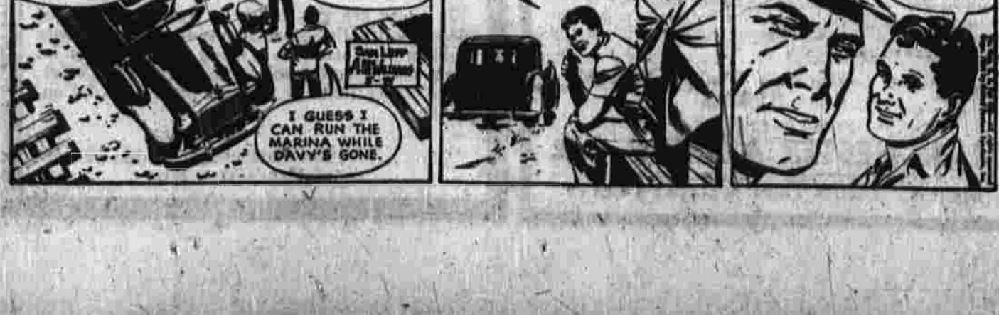
BY LEFF AND McWILLIAMS