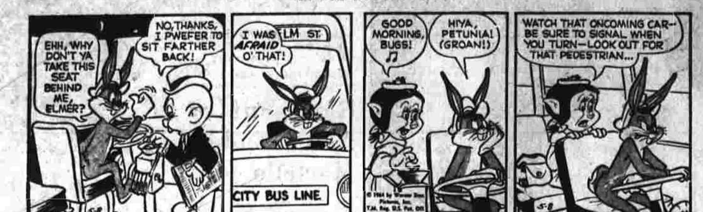
CITY BUS LINE