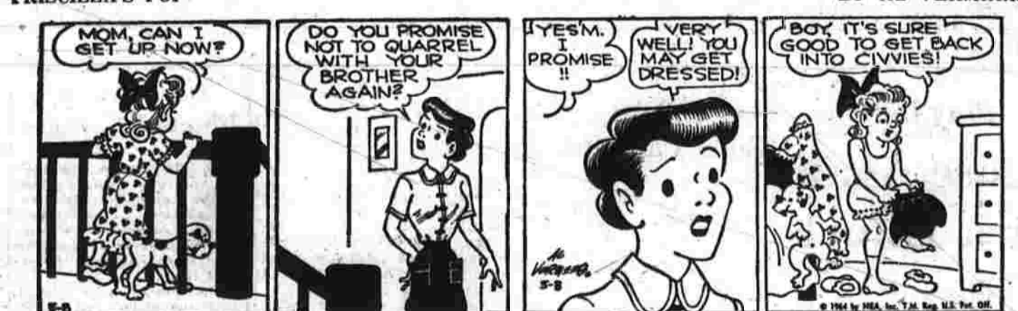
BY AL VERMKER