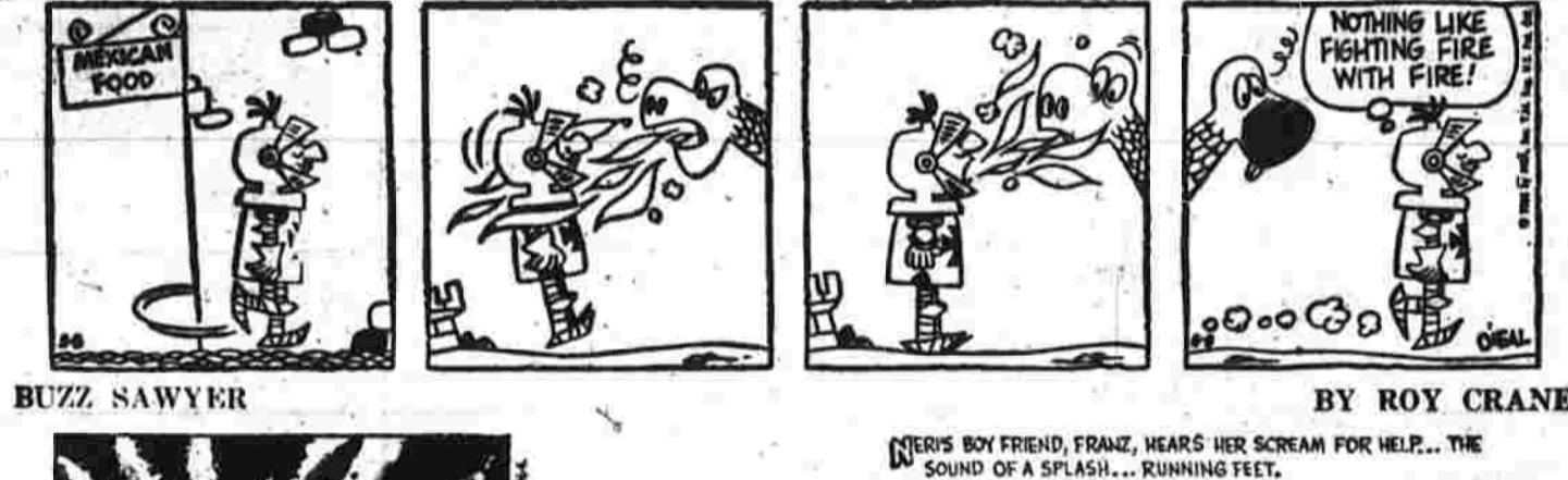
BY FRANK O'NEAL