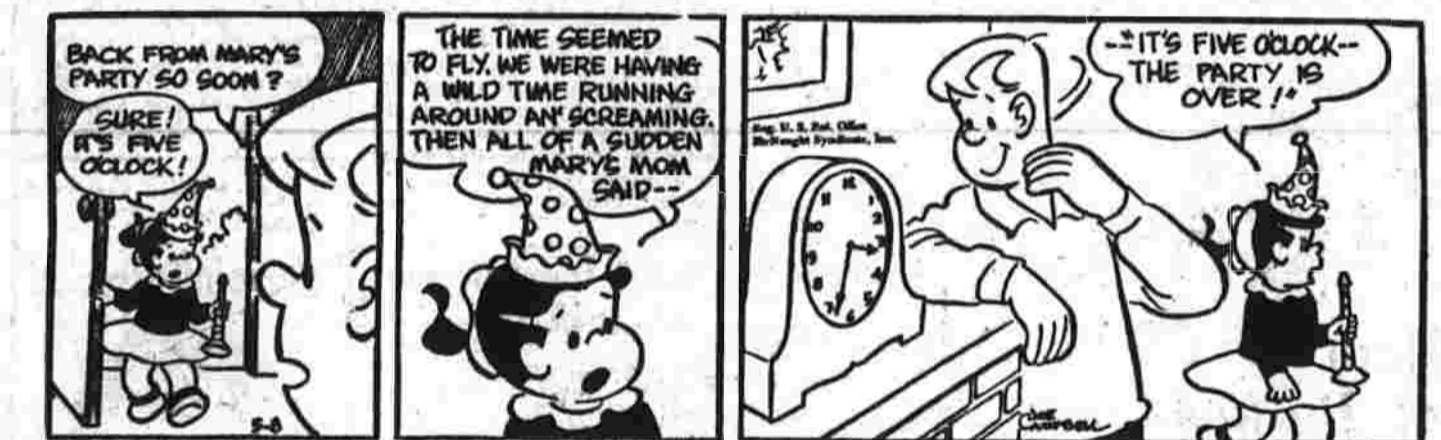
BY JOE CAMPBELL