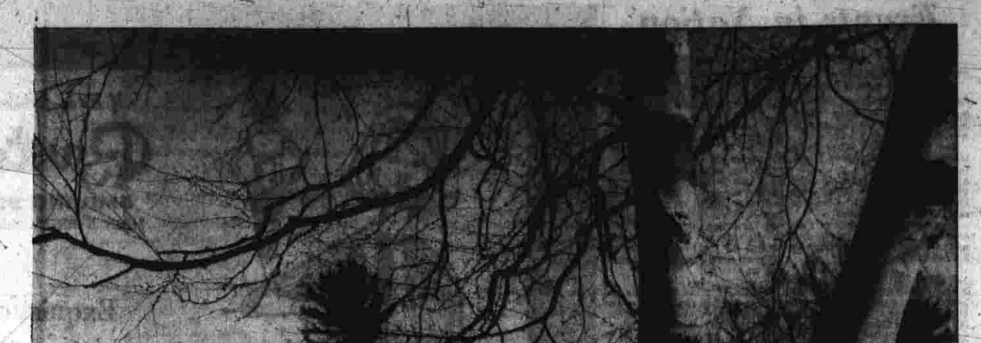
UNIVERSITY OF CONNECTICUT: Looking Toward Wilbur Cross Library, Storrs Hall

Everybody, we note, is still bemoaning the fate of the Seneca Indians, that tribe of some 700 out in western New York State who must be off their ancestral acres by next October if they don't want to be flooded by the waters impounded by one of the white man's new dams.